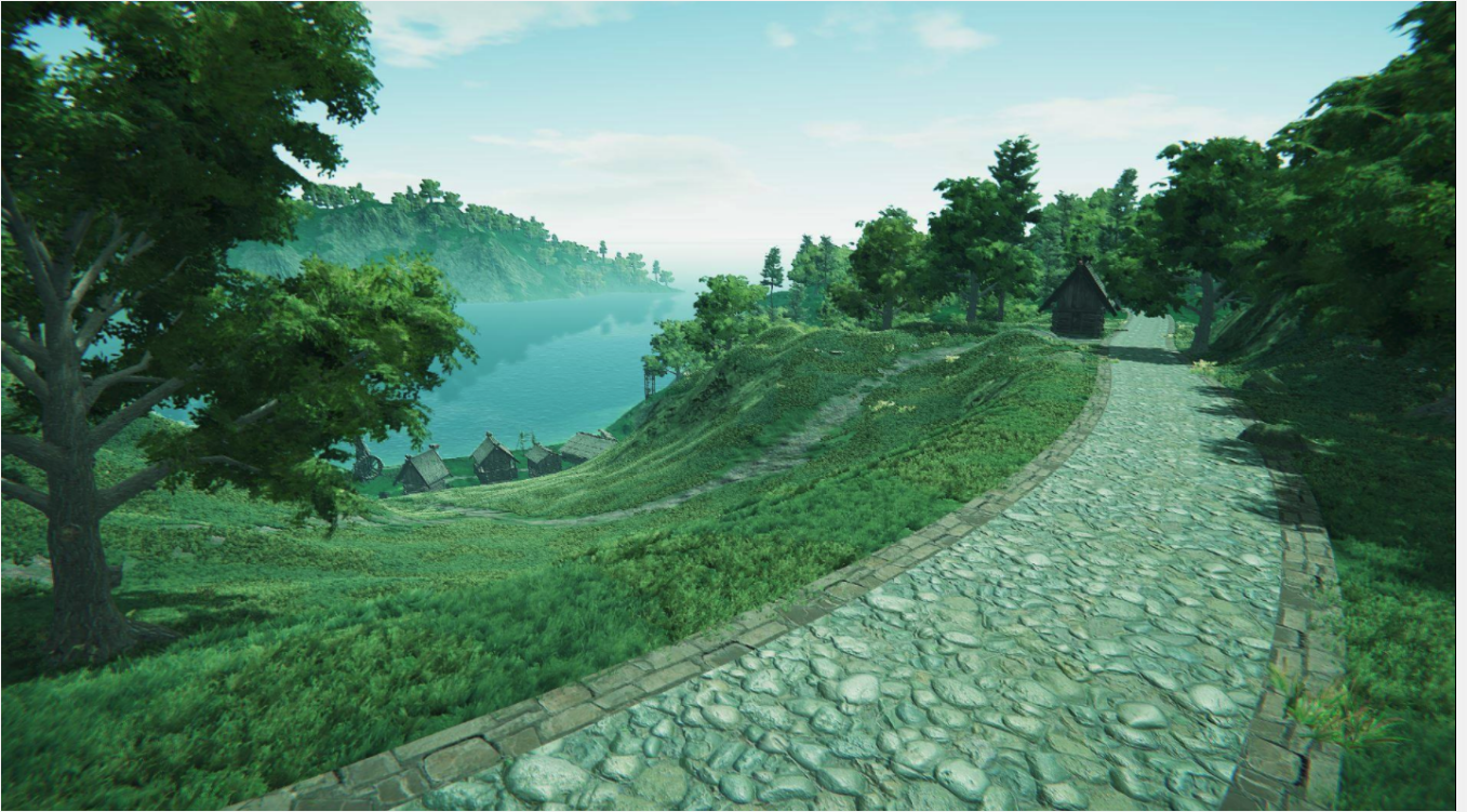
In the distance you can see the vegetation color mask blended with the terrain