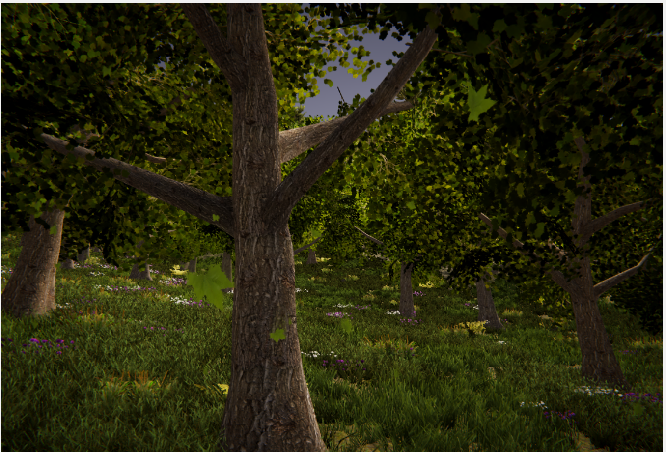
Image showing the falling leaves.

In this example video we added a prefab with a falling leaves particle effect to one of the tree models. When any tree of this type gets within range it will instantiate a copy of the effect with the same position as the tree. When it is out of range it is removed automatically. This will allow for effects on huge amounts of trees or plants with no overhead of culling and gameobject hierarchy handling.